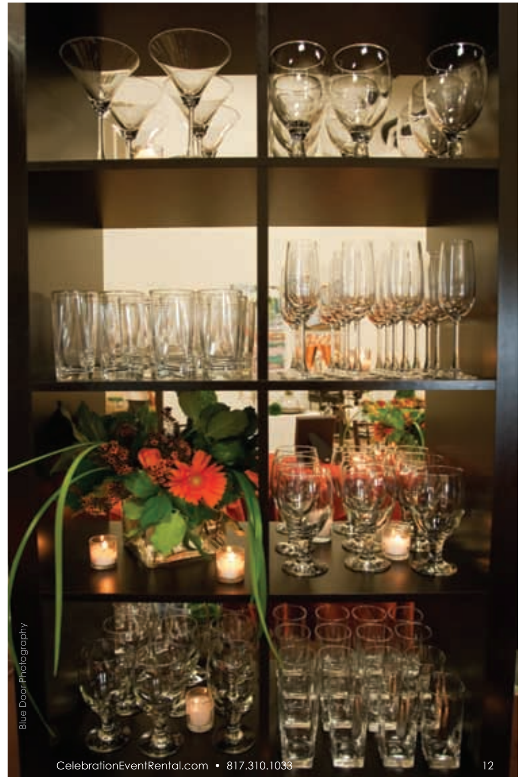
Blue Door Photography

Custom printed styrofoam and plastic cups are available in various styles, sizes and colors. Please call for pricing.