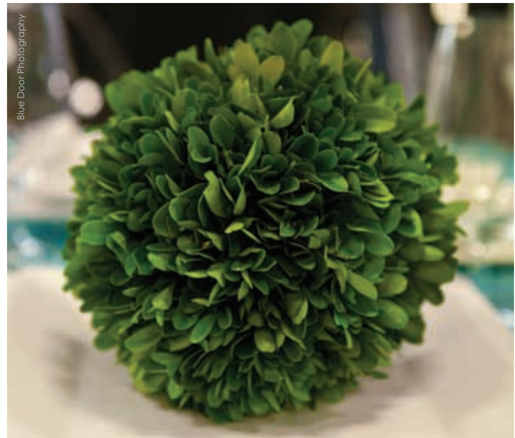
Blue Door Photography