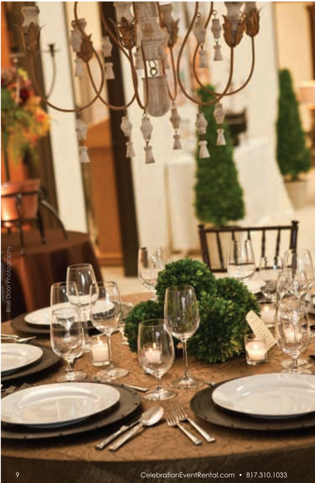
Blue Door Photography