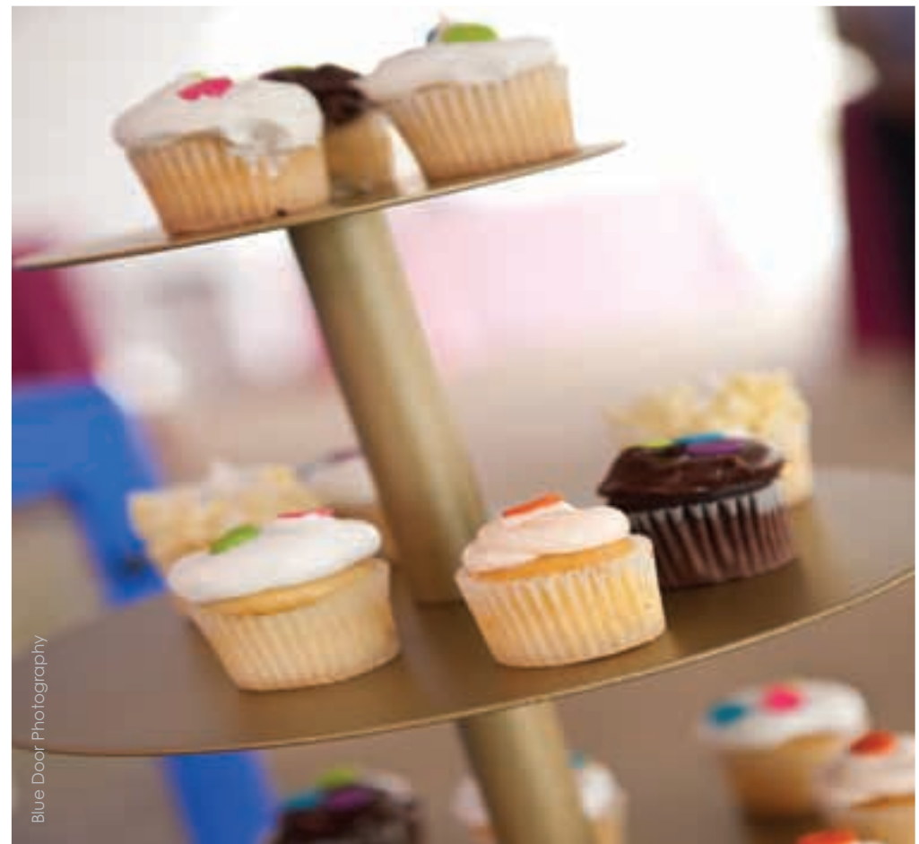
Blue Door Photography