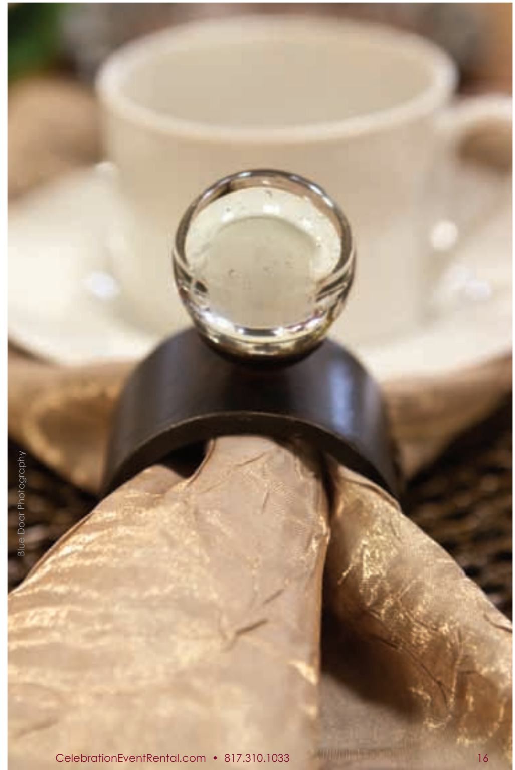
Blue Door Photography